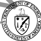
FEDERICO F. PEÑA Secretary of Energy